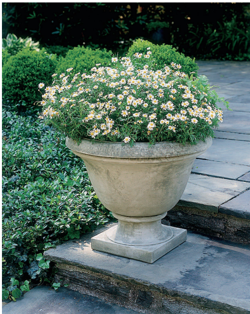
Campania "Greenwich Urn" 27" Diameter